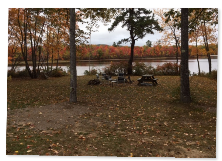
Sent from my iPhone