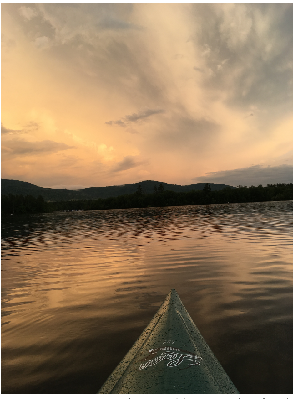
Come for renewal, learning and profound experience

Okay, so the pictures were taken from my old phone on a cloudy day. You can imagine a lodge on a lake in the mountains in fall when the crowds are gone and the sun is still warm. The loons are singing, turtles nap on rocks and an eagle soars over head. This lake is my favorite spot on earth. The lodge seems fairly new and very clean. It was built as a place for Marist brothers and others to gather for retreat, connection and inspiration. This is a place to let your body open and your heart expand. You'll leave with experiences you'll always remember and skills that will deepen and expand your work. Come play!